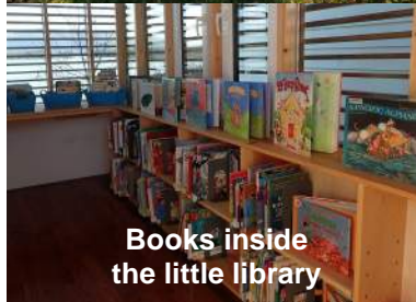
Books inside the little library