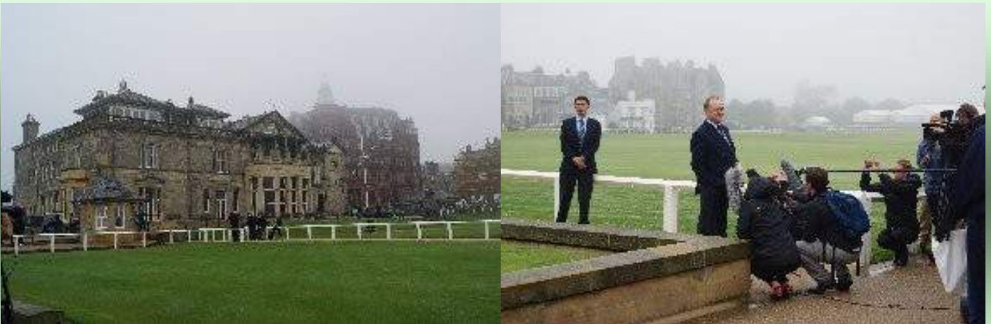
Picture of the Club House