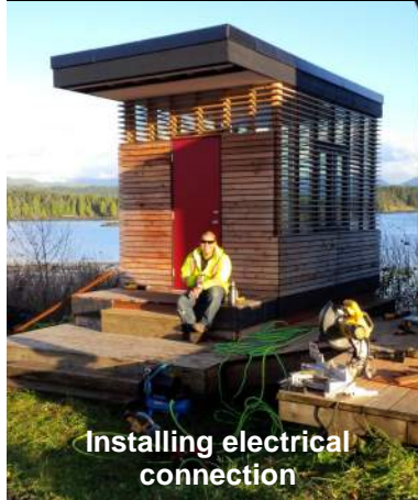
Installing electrical connection