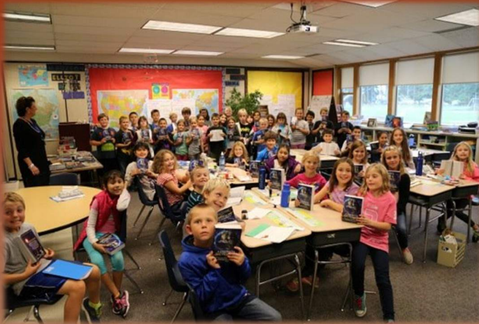
Students posing for a picture with their dictionaries.