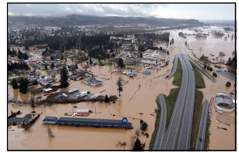
2007 Chehalis Flood