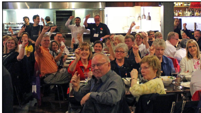
District Get Together at the Bah-B-Q Restaurant at the end of the Convention.