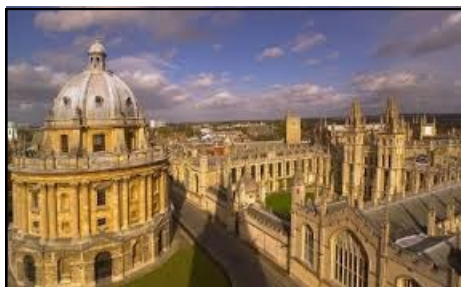
London (UK) School of Economics

young woman with a passion for all that Rotary International stands for— and we have seen her in action as she has served both her community here in Langley and has served the poor and needy overseas. Her vision to empower women and children in developing countries to pull themselves out of poverty to support their families through micro-business is exciting."