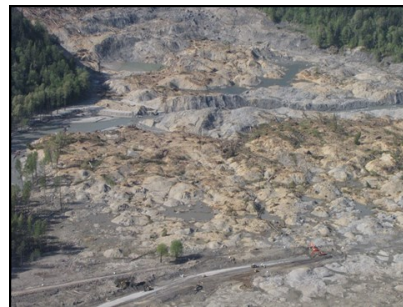
Oso Landslide Blocking Highway 530