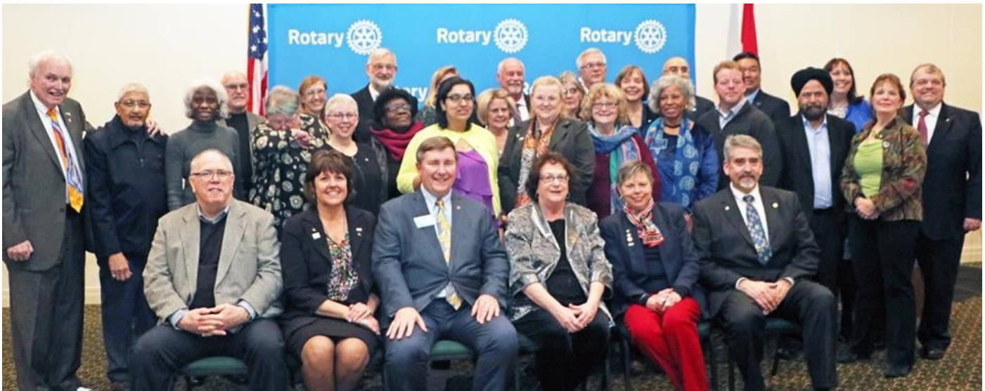
Charter Members of District 5050 PNW Passport Club