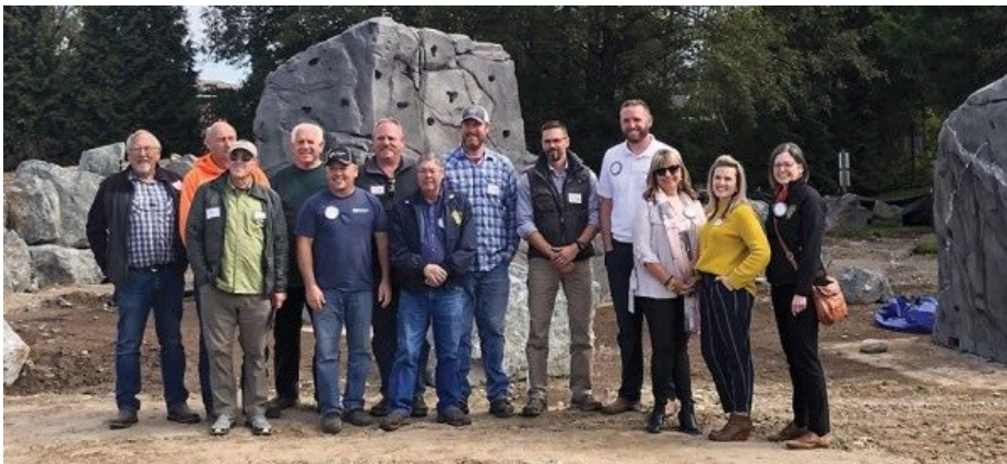
Representatives of the Mount Baker Rotary Club and its Founder Level ($10,000+) of donors received an early look at the climbing boulders being installed.

Mount Baker Rotary Club didn't take the cheap route, either. The first two man-made climbing boulders were transported from Colorado. One weighs 18,000 pounds and is 10 feet high,