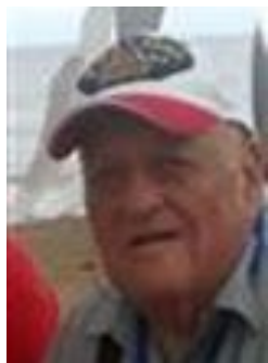
Bud Compton Rotary Club of Arlington 1925—2019