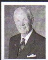
Rotary International President Wilf Wilkinson

The details about the April 25-27, 2008, Rotary World Peace Summit in North American are available at www.rotarypeacesummit.org .