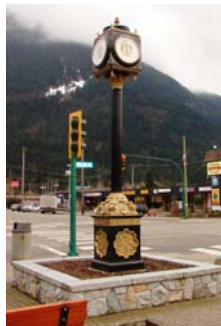
Rotary Clock presented to the city of Hope as part of the Rotary Centennial in 2005.

After crossing the border and checking into a Best Western Hotel in Aldergrove, we drove about one hour east to the small city of Hope.