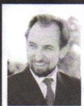
Jordanian UN Ambassador HRH Prince Zeid Ra'ad