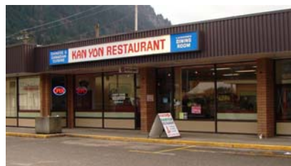
The Chinese restaurant where the Rotary Club of Hope meets on Thursday night at 6:30 p.m.