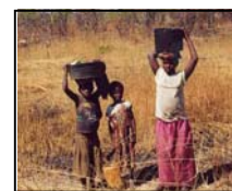
Three village girls carrying water.

What is the value of available pure water? If the only water available for your family is a murky bacteria-laden carrier of disease and possibly death for your children – and each day it must be fetched, some places requiring several hours to bring one bucketful for all of the family's daily needs – what would a pure water well nearby be worth to you? In such regions a crew equipped with a light weight drill-rig can bring as much or more relief from human suffering and death as a hospital.