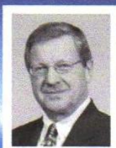
Nobel Peace Prize Nominee Lloyd Axworthy