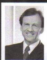
Former UN Ambassador Allan Rock