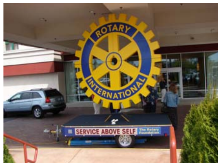
The Jubies' big Rotary wheel