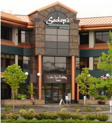
Sockeye's Restaurant & Bar 14090 Fryelands Blvd. SE (at Hwy 2) Meetings: Wednesday at noon