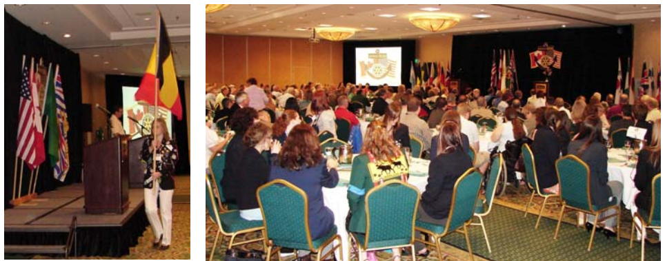
The opening lunch and the entry of the flags of the nations with youth exchange students.