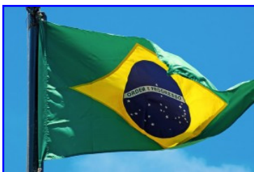
Flag of Brazil