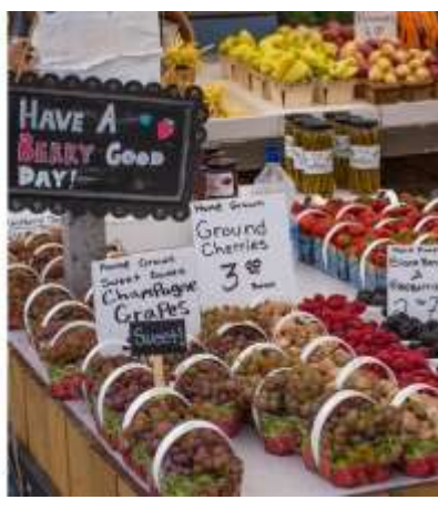
Day 1: Thursday, June 28, 2018 Toronto, Ontario - Rockport - Ottawa Driving north of Lake Ontario takes you to Rockport, gateway to one of the world's most beautiful areas. Enjoy a memorable cruise through the unspoiled region of the spectacular 1000 Islands, found on the border between the United States and Canada. Later this afternoon, arrive in Ottawa, the beautiful and cosmopolitan capital city of Canada. Tonight, join your fellow travelers for a welcome dinner. ( D )

Day 2: Friday, June 29, 2018 Ottawa, Ontario - Quebec City This morning, savor the flavor of a local specialty - a beavertail - while you enjoy a stroll through the Byward Market, known for its fruits, vegetables, flowers, and arts & crafts. Next, embark on a city tour showcasing the Rideau Canal (in winter the world's largest skating rink) and the Parliament buildings. This afternoon, depart for fabulous Quebec City. ( B )