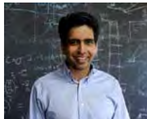
SAL KHAN CEO of Khan Academy