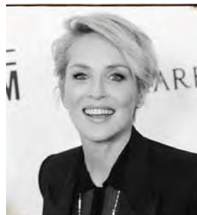
Actress & Activist Sharon Stone

women around the world who are actively transforming and healing global society on a daily basis.