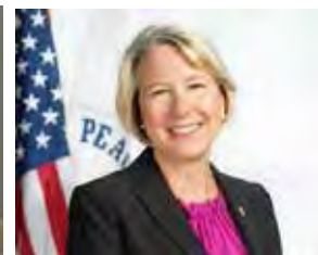
CARRIE HESSLER-RADELET Director of the Peace Corp