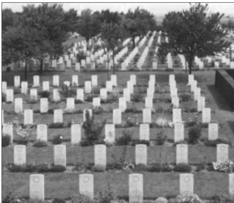
BENY-SUR-MER CANADIAN WAR CEMETERY.

symbolize the sacrifice made by Canadians in the Second World War, in Korea, and in subsequent peacekeeping missions. The National War Memorial symbolizes the unstinting and courageous way Canadians give their service when values they believe in are threatened. Advancing together through a large archway are figures representing the hundreds of thousands of Canadians who have answered the call to serve; at the top of the arch are two figures, emblems of peace and freedom.