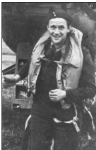
AN AIRMAN PRIOR TO THE DIEPPE RAID.

Those who came forward had not stopped to count the cost, for the excitement was thrilling, the lottery alluring, and the cause glorious; but now that the confusion was passed, and the fulfilment of vows alone remained to be faced, things took on a more sombre aspect .... 4