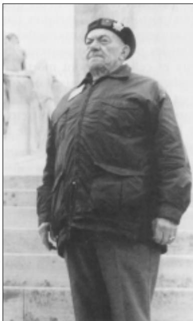
FIRST WORLD WAR VETERAN AT BASE OF VIMY MEMORIAL WHERE 11,285 NAMES ARE INSCRIBED IN THE STONE.

The two minutes of silence provide another significant way of remembering wartime while thinking of peace. Two minutes are scarcely enough time for thought and reflection. As we pause and bow our heads, we remember those brave men and women who courageously volunteered for the cause of freedom and peace.