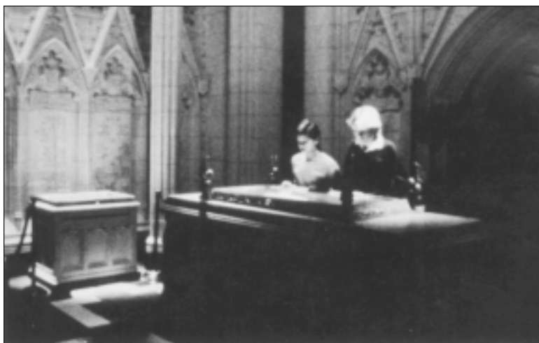
TWO YOUNG BENEFICIARIES OF CANADIAN SERVICE AND SACRIFICE OVERSEAS CONTEMPLATE THE NAMES OF THOSE WHO FELL.

Every year on November 11, Canadians pause in a silent moment of remembrance for the men and women who have served, and continue to serve our country during times of war, conflict and peace. We honour those who fought for Canada in the First World War (1914-1918), the Second World War (1939-1945), and the Korean War (1950-1953), as well as those who have served since then. More than 1,500,000 Canadians have served our country in this way, and more than 100,000 have died. They gave their lives and their futures so that we may live in peace.