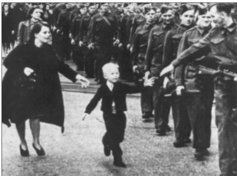
CANADIANS DEPARTING FOR ACTIVE SERVICE IN EUROPE DURING THE SECOND WORLD WAR, 1940.

By remembering their service and their sacrifice, we recognize the tradition of freedom these men and women fought to preserve. They believed that their actions in the present would make a significant difference for the future, but it is up to us to ensure that their dream of peace is realized. On Remembrance Day, we acknowledge the courage and sacrifice of those who served their country and acknowledge our responsibility to work for the peace they fought hard to achieve.