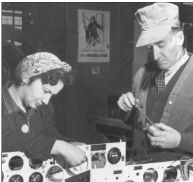
WORKERS ASSEMBLING INSTRUMENT PANELS FOR “RAM” TANKS, JULY 1942.

When will it all end? The idiocy and the tension, the dying of young men, the destruction of homes, of cities, starvation, exhaustion, disease, children parentless and lost, cages full of shivering, starving prisoners, long lines of civilians plodding through mud, the endless pounding of the battle-line. 5