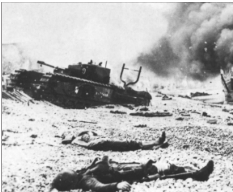
THE DIEPPE RAID, AUGUST 1942.

During the Second World War, Canadians fought valiantly on battlefronts around the world. More than one million men and women enlisted in the navy, the army and the air force. They were prepared to face any ordeal for the sake of freedom.