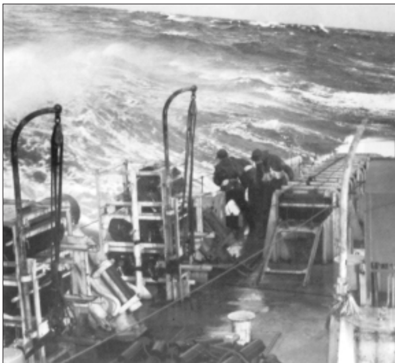
HMCS SWANSEA IN ROUGH SEAS, DURING THE BATTLE OF THE ATLANTIC, JANUARY 1944.

For all of these conflicts fought in far-off lands, there is much to remember. Foremost are the people, the men and women who served wherever they were needed. They faced difficult situations bravely and brought honour to themselves, to their loved ones and to their country. They were ordinary Canadians who made extraordinary sacrifices.