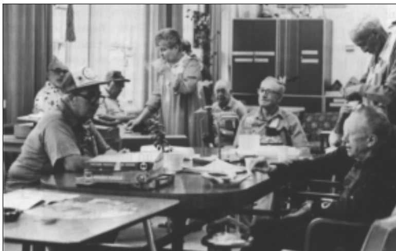
STE. ANNE'S HOSPITAL, JULY 1984.

The Tomb of the Unknown Soldier is located next to the National War Memorial and contains the remains of an unknown Canadian First World War soldier who was exhumed from a cemetery near Vimy Ridge. The Tomb and its Unknown Soldier represents all Canadians, whether they be navy, army, air force or merchant marine, who died or may die for their country in all conflicts - past, present, and future.