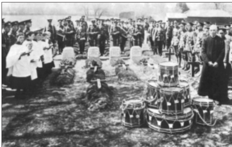
FUNERAL SERVICE FOR CANADIANS AT BRAMSHOTT DURING THE FIRST WORLD WAR.

During times of war, individual acts of heroism occur frequently; only a few are ever recorded and receive official recognition. By remembering all who have served, we recognize their willingly-endured hardships and fears, taken upon themselves so that we could live in peace.