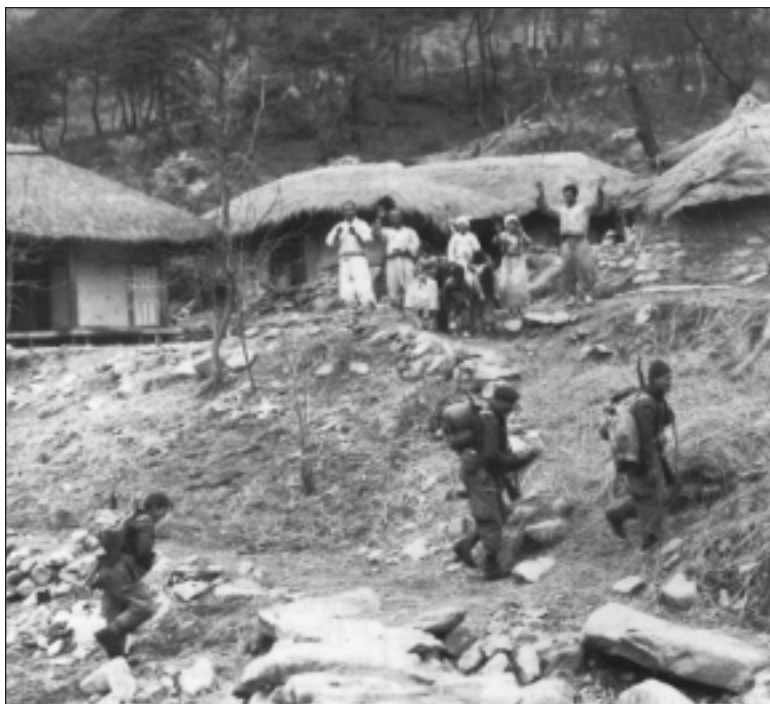
TROOPS OF 2 ND PPCLI DURING PATROL, MARCH 1951.

From all of these records of wars, the observations of the individuals who took part stand out as reminders of the true nature of conflict. Through knowledge of the realities, we may work more diligently to prevent them from happening again.