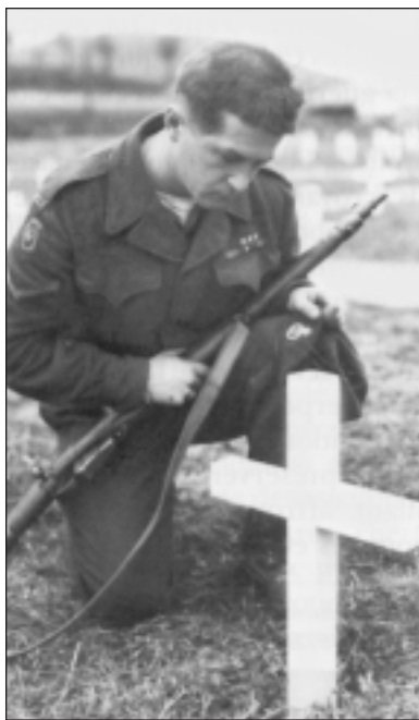
A CANADIAN SOLDIER KNEELS AT GRAVE OF FALLEN COMRADE IN THE UNITED NATIONS CEMETERY, KOREA. APRIL 1951.

These wars touched the lives of Canadians of all ages, all races, all social classes. Fathers, sons, daughters, sweethearts: they were killed in action, they were wounded, and thousands who returned were forced to live the rest of their lives with the physical and mental scars of war. The people who stayed in Canada also served - in factories, in voluntary service organizations, wherever they were needed.