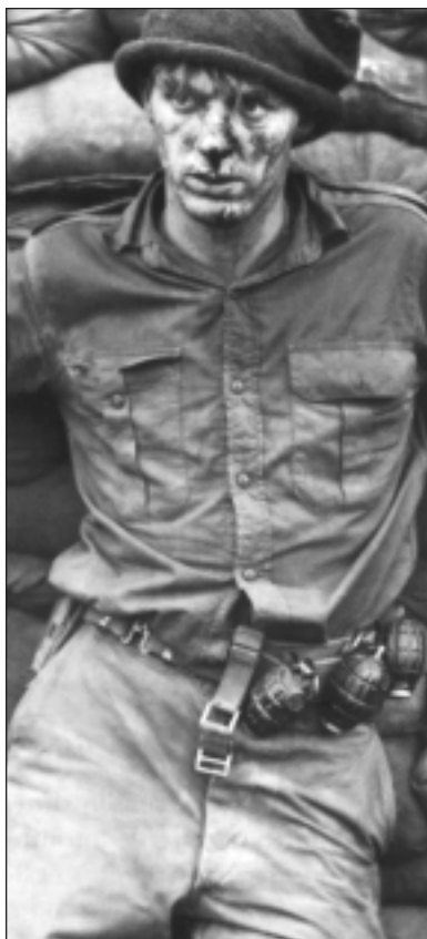
SOLDIER OF 1 ST RCR AWAITING MEDICAL AID AFTER NIGHT PATROL, JUNE 1952.

The beach was a shambles, and a lot of our men from the second wave were lying there either wounded or dead. Some of the wounded were swimming out to meet our flotilla and the sea was red with their blood. Some sank and disappeared. We stood by as they died, powerless to help; we were there to fight, not to pick up the drowning and the wounded. But the whole operation was beginning to look like a disaster. 8