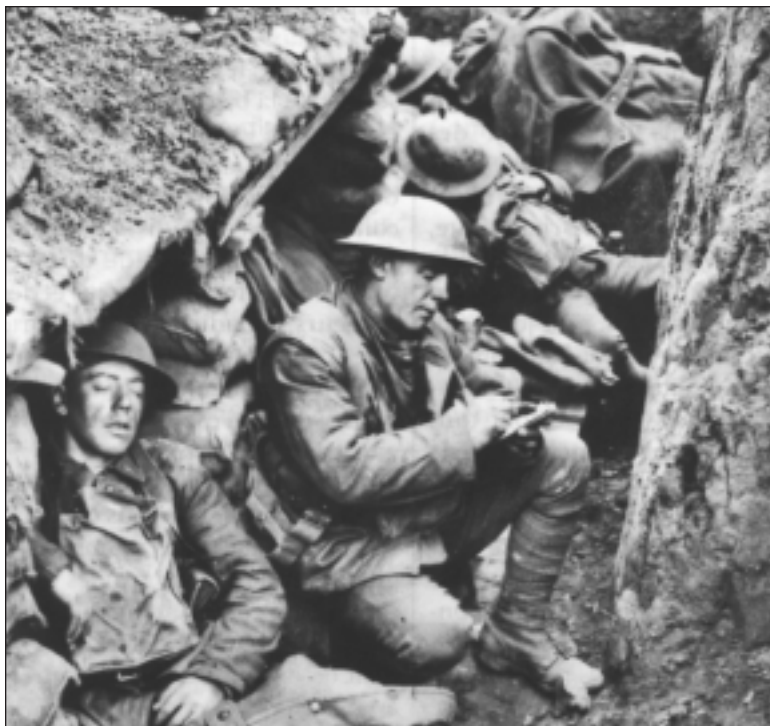
CANADIANS IN A FRONT LINE TRENCH DURING THE FIRST WORLD WAR, FEBRUARY 1918.

Since the end of the overt hostilities in Korea more than 50 years ago, Canadian soldiers have come to play a different, yet essential, role on the world stage. Our commitment and skills as peacekeepers has gained Canada respect and influence the world over.