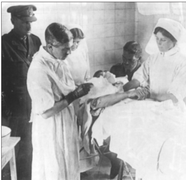
A MAN BEING OPERATED ON IN A CANADIAN FIELD AMBULANCE WITHIN AN HOUR OF BEING WOUNDED, OCTOBER 1916.

Those who experienced the blood and carnage of battle believed that their efforts had made the world a safer place. Yet only a few years after the end of the Second World War, Canadians were again called to uphold the cause of peace and freedom. From 1950 to 1955, Canadian men and women served under the United Nations flag in Korea. They included new recruits as well as veterans from the previous war. Along with various army units, the navy and the air force provided vital support and endured months of hardship in the hope of maintaining world peace.