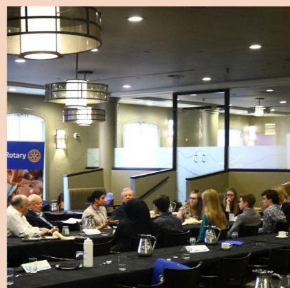
AIPF's first session (2019)