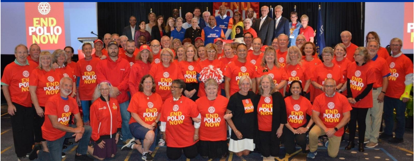
Partners celebrate the Government of Canada's new pledge to the GPEI of Can$ 151 million.