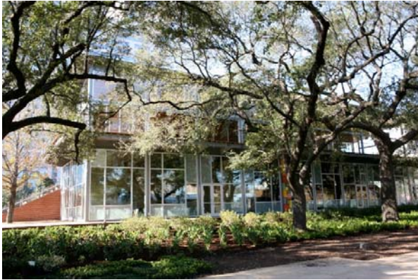
The Grove, 1611 Lamar Street, Houston (in the southwest corner of Discovery Park)