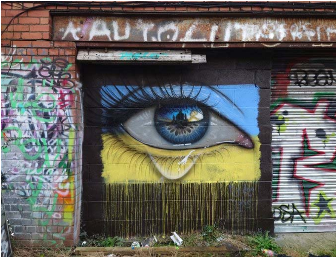
Street art which anonymously appeared in Cardiff, Wales

If you have a couple of Clubs in your District who would like to come together to watch this film, please contact the Editor on ypalison@yahoo.co.uk