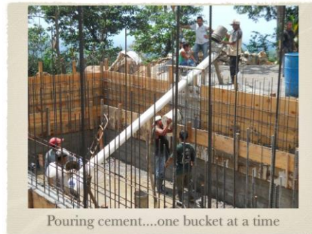
Pouring cement....one bucket at a time