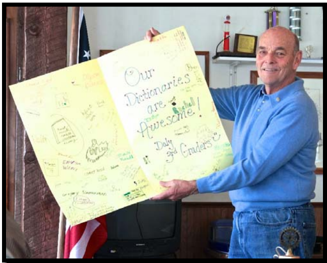
Hamilton Rotarians enjoyed reading a giant thank you card from the Daly School 3rd graders who received their new dictionaries from the club.