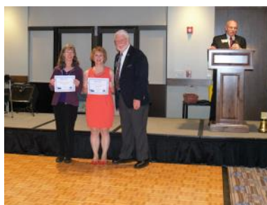
RI President's Citations