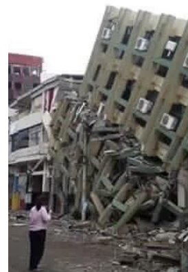
Building Collapse in Portoviejo