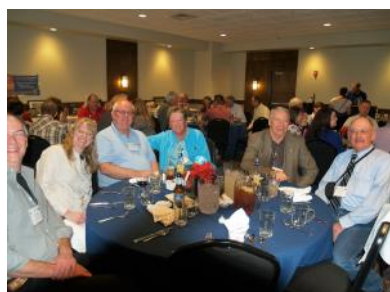
The "Townsend Table" successfully bid both nights for first in line for dinner.