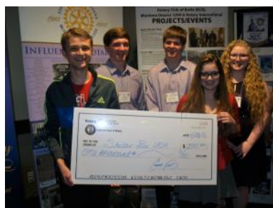
Butte Interact Club raised $1,000