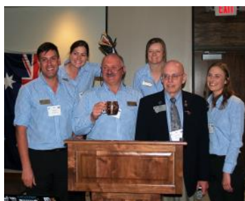
Tasmanian PDE Team