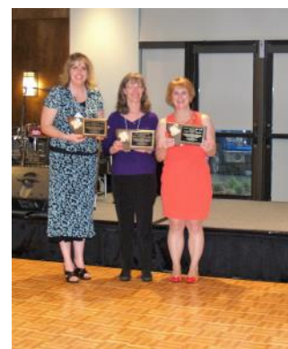
Best Small, Medium & Large Clubs of the Year