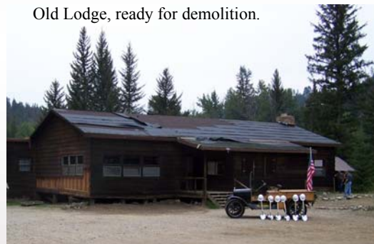
Old Lodge, ready for demolition.