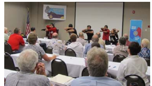
Wrecking Clown Crew members entertained with Hip Hop moves.