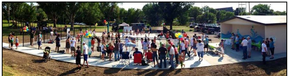
Glendive families enjoy the new Splash Park on opening day, Sunday, August 11th.