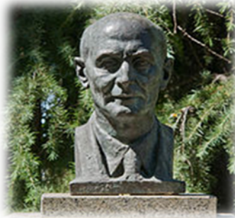
Bust of Paul Harris in Madrid, Spain

Rotary club in Chicago, Illinois in 1905. He wanted to organize a club that would bring together a group of business and profes-