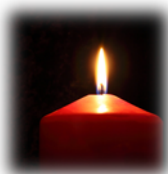
Light Up Rotary