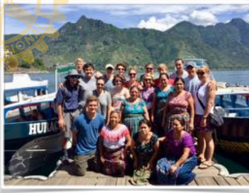
Interact members with Guatemalans on Lake Atitlan.

On June 15, their dream became a reality. Ten Townsend Interact students, the club's advisor, and four chaperones traveled to Guatemala for a nine-day service and cultural understanding trip. Upon arrival in the Central American country, club members volunteered at Maya Pedal, a non-profit Guatemalan organization that builds self-sustainable projects to improve the environment, health, productivity, and economy of rural families. The club worked with students from a local school to build bio-sand water filters for four families, built a display shelter for Maya Pedal's workshop, and teamed up with a young women's organization called Let Girls Lead to install trash receptacles in the community. The club members visited a local school to meet and share stories