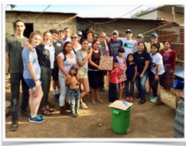
Interact members pose with their new Guatemalan friends.