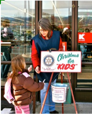
Hamilton Rotarians spend part of the Christmas season collecting money in front of K-Mart for their Christmas for Kids program.