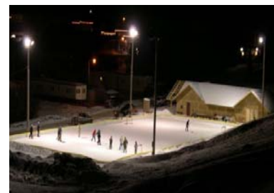
Philipsburg residents enjoy the Winninghoff Park Ice Rink built by local Rotarians.