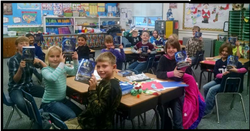
Whitehall 3rd Graders are happy about having their own dictionary.

District Conference Kalispell April 24-25, 2015