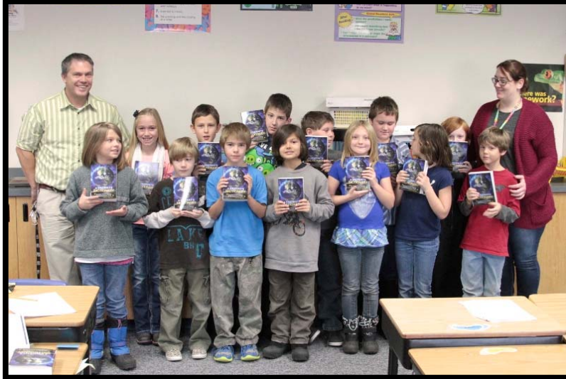
Victor 3rd Graders show off their new dictionaries provided by the Hamilton Rotary Club.