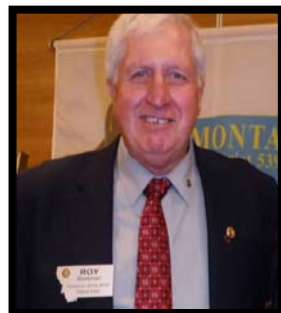
2014-15 District Governor

Fittingly, December's Rotary focus is family. I reflect on this past year and my Rotary family. It grew by leaps and bounds as I traveled across the district visiting all the clubs. I increased what I consider my Rotary family in every town I visited and in every club I had the joy of attending meet-