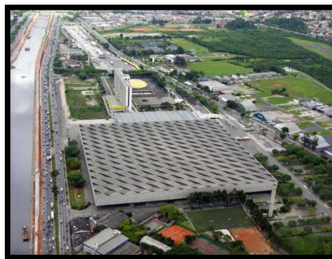
Anhembi Convention Center, Sao Paulo