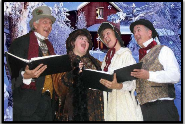
Some old fashioned Christmas Caroling in Great Falls.