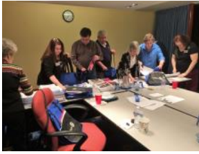
Stuffing Tote Bags with materials for PEs and PENs.

Presidents Elect and President Elect Nominees from our District attended training in Denver to prepare them for their year leading their clubs. Although training was intensive over the course of the weekend, there was still some time for “team building” and networking.