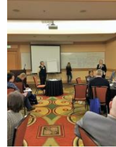
Attendees Shared their “Great Ideas” for Stronger Clubs