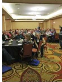
District Breakout Session