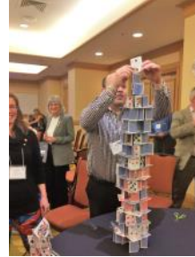
Team Building Exercise