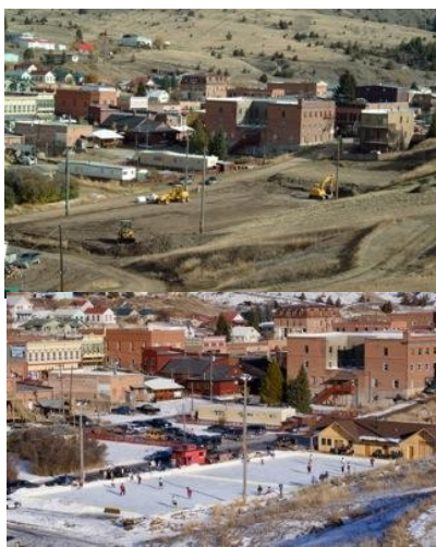
Dreams turn bare dirt into a new sports complex in the small town of Philipsburg. Thanks to a Rotary grant, lots of hard work and fundraising, the community now has a great place to play.