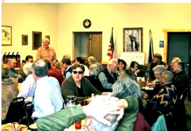
Hamilton Rotarians and other community leaders gathered recently to learn more about the problem of drunk driving and solutions for their area.