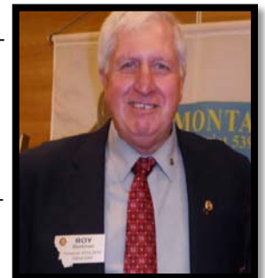
2014-15 District Governor

During World Understanding Month, Rotary clubs focus on projects and programs that promote peace and reduce conflict in our communities and around the world. (continued, P. 6)