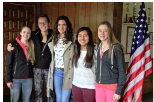
Corvallis High School Interact Club Members

Five young ladies from the Corvallis High School Interact Club recently attended the meeting of the Rotary Club of Hamilton. The Hamilton Rotary Club is also sponsoring a new Interact Club to be formed at the Darby High School.