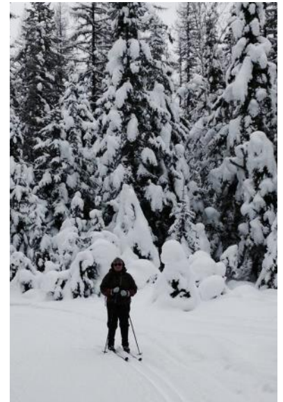
Malinda Cross Country Skiing at Jewel Basin!