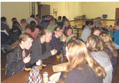
Whitehall Interactors take a break before beginning their January 6 meeting. The group includes nearly 30% of the high school student body.