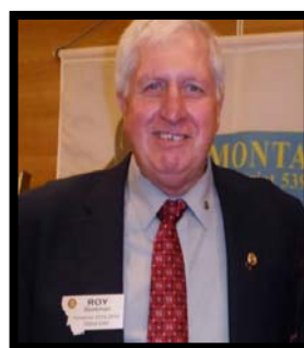
2014-15 District Governor