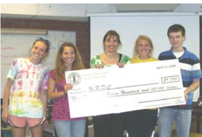
Members of the Bozeman Interact Club presented a nice "size" check to the Human Resource Development Council.