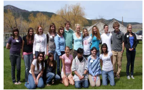
District 5390 outbound Youth Exchange students gathered at Fairmont Hot Springs near Butte in May to receive their orientation training.