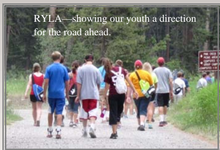
RYLA—showing our youth a direction for the road ahead.