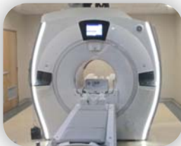
MRI unit part of hospital tour.

stepped up their July 21st meeting by stepping out after lunch to learn about the diagnostic equipment available at the Marcus Daly Memorial Hospital. On-site visits to local businesses is a great way to change the weekly pace of club programs and become more familiar with the local community.