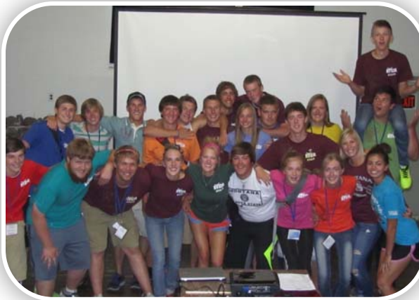
Our incredible group of young leaders. Meet the Junior and Senior Counselors and our new Young Adult Staff. Their contributions made the 2014 RYLA Camp extra special for everyone.

woman was very thankful to be there because she had made