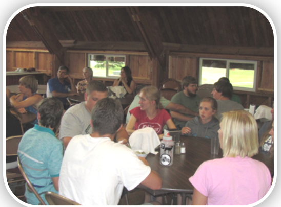
Thanks to the newer commercial dishwasher, there was a ready supply of dishes, glasses and flatware for every meal. The kitchen crew is loving the much faster cook times with the double convection ovens. Thank you to all the clubs and individuals who made this possible through financial support.

RYLA 2015 will take place at Luccock Park Camp on July 14 through 18. There will likely be a slight increase ($20 per camper) for next year. Still low cost and very high impact.