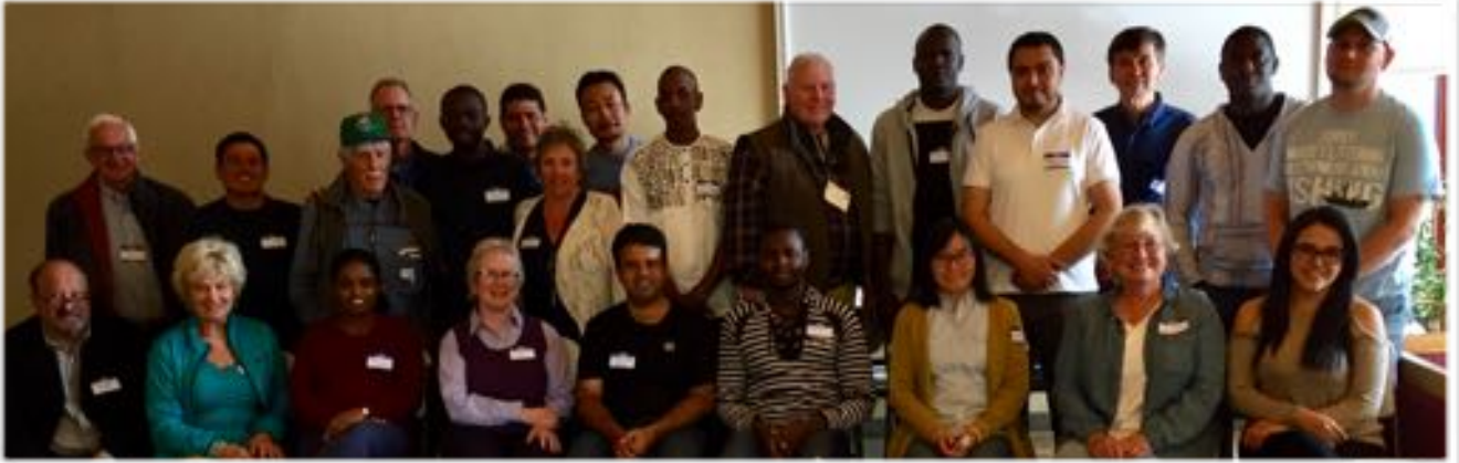
Rotary members, guests and Humphrey Fellows pose for a group photo at the June 23 barbecue in Missoula.