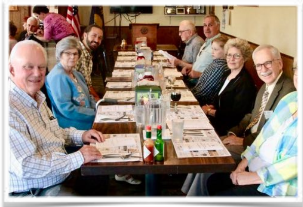
Waiting for our food!