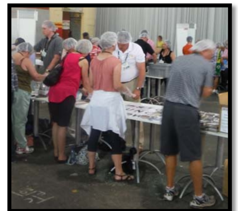
Rotarians volunteer their time during the convention for Stop Hunger Now. Dozens of boxes of food were packaged for the needy.