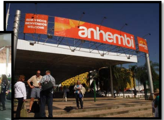
The 2015 Rotary International Convention in Sao Paulo, Brazil

Youth was well represented at the convention. The Interact session was presented by student members from California.