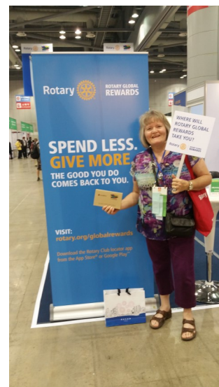
Me winning the Samsung tablet

At an RI Convention and yes, I now have lots of contacts for international projects and contacts to start a "Rockhound" Fellowship. We heard from the Secretary General of the United Nations and the President/CEO of National Geographic among