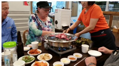
Traditional Korean BBQ