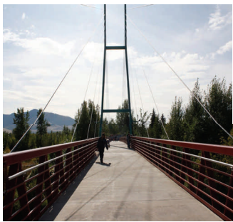
The California Street Footbridge in Missoula has become an improvement for kids from the Shirley Miller Attention Home thanks to an investment by Rotarians of the Missoula Noon Club.

Thich Nhat Hanh Vietnamese Zen Buddhist monk