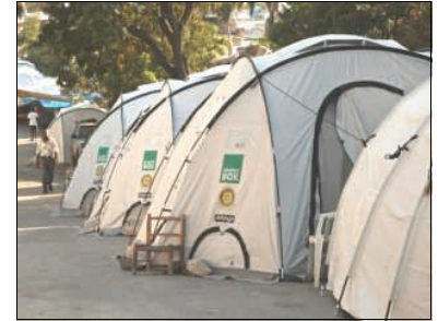
More than 10,000 Shelter Boxes have been distributed to those left homeless after the Haiti earthquake. Kalispell Rotarians are helping to provide more. The Noon club raised money for 8 and the Daybreak club will help with 3.