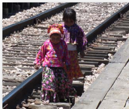
Tarahumara children play on the tracks while their mother is busy nearby selling her hand woven baskets.

can be seen weaving intricate baskets from the very long pine needles of the area trees. Younger children and women are often seen at train stops made by El Chepe as it traverses from Los Mochas to Chihuahau each day.