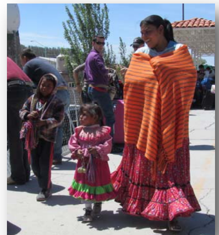
Children selling handmade items at the Creel train station in the Copper Canyon area. (Photos are not from the Bozeman group's grant trip.)

The kitchen improvements for the camp are planned to take place during May. The campers will be given the opportunity to do simple service projects while at camp. Last summer each camper had the opportunity to help paint a mural in the hallway between the dining and meetings halls.