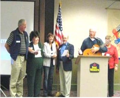
"Singing" the praises of Rotary during the District Assembly in Great Falls on October 24th.