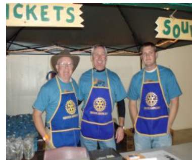
Great Falls Rotarians had a great time putting on their annual Harvest Howl for Camp Rotary.

The Iron Lungs are being used on a steady basis. Red Lodge used the east unit during a spooky Halloween fundraiser at the Polard Hotel and will use it again during their community's Christmas Stroll in December. Livingston made good use of it the next weekend and now it is in Butte for several weeks where Rotarians have arranged to have it on display at businesses around town. The west unit will be in Whitefish for awhile. If you want to schedule one of the iron lungs, check the calendar on the District web site.