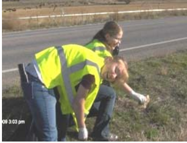
Highway cleanup is a “bunch of garbage”; but, these Corvallis Interactors don’t seem to mind. Twenty-one students helped with the cleanup.