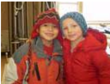
All smiles in Livingston after receiving their winter coats from Rotarians during the Cool Coat Day.

Which club in our district is the “Middle Child?” In other words, which club was number 21 to charter?