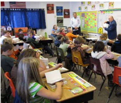
One of the nice things about the Dictionary Project is the opportunity to serve beyond our communities. Missoula Sunrise (above) visited 3rd graders in Charlo and Whitehall Rotarians made sure that Harrison kids (below) received their dictionaries.