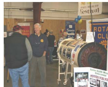
Livingston Rotarians used the Iron Lung during the Livingston Health Fair to help educate people about polio and Rotary's work to help eradicate it.