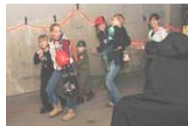
Livingston area visitors getting "spooked" in the Haunted House put on by the Rotary Club of Livingston.

I have a hard time finding the words to thank Rotary for the opportunities you have given me to broaden and deepen my peacemaking and conflict transformation work, and bring the (continued, p. 6)