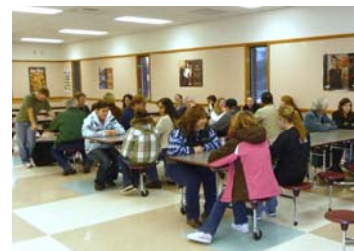
The Rotary Club of Whitehall held an appreciation dinner on Oct. 26th for Interactors and their parents. Although many of the 51 members could not make it due to flu, there was still a great crowd. 28% of the Whitehall High students belong to Interact.

*My club is not participating. Can I still get one of the books? YES. You can buy a book from the District or a participating club for the suggested retail price. Profits from (cont. p. 6)