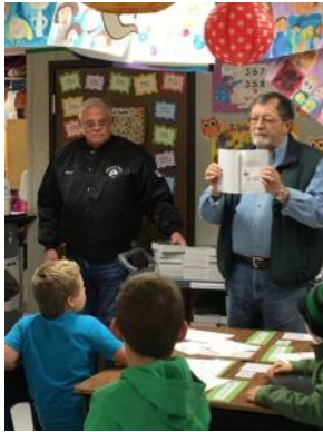
Hamilton Rotary Club Delivers Dictionaries to Darby and Corvallis