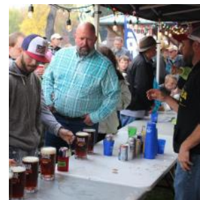
Townsend Rotary Club's Beer and Brats Booth