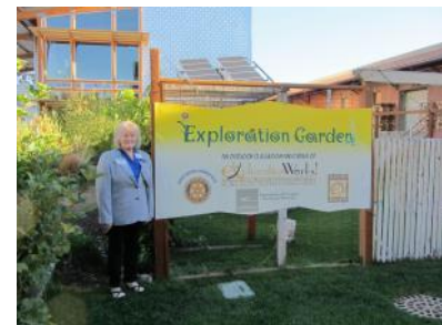
Exploration Works Garden in Helena

There are many more, too numerous to mention. I am proud of all our Rotary clubs who are improving their communities and they should be too. Don't forget to showcase your project work in your community by working to get radio or newspaper coverage. Use social media to post pictures of your project work and post a ROTARY sign/plaque on or near the project.