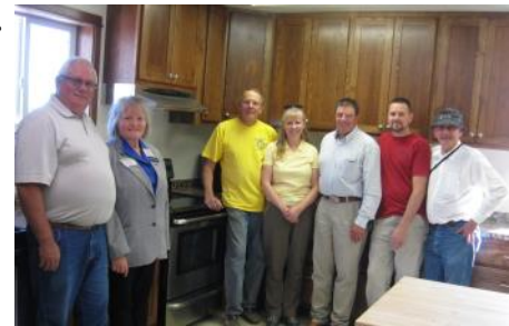
4H Building Kitchen in Townsend