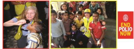
Final Push – Calling Rotarians Volunteers