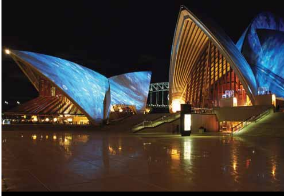
Enjoy a memorable evening at the iconic Sydney Opera House, listening to the notable Sydney Symphonic Orchestra whilst taking in the magnificent views of Sydney, the harbour foreshore and it's surround.

Thinking of things to do while in Sydney? Why not visit the Sydney Opera House and attend a concert or performance in this well-known Australian landmark. With its iconic setting, grand interior and cathedral-like ambience, the world-renowned Sydney Opera House is one of the most prestigious performing spaces around. Immerse yourself in the architecture and witness a range of extraordinary performances bought to you by the Sydney Symphony Orchestra, Music House and Australian Chamber Orchestra.