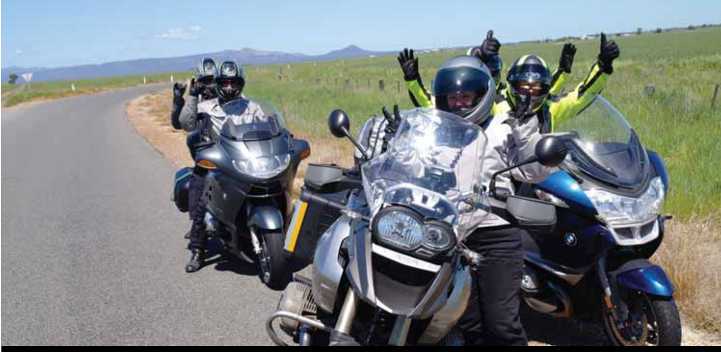
Why not see New South Wales (NSW) in an adventurous and different sort of way! You can join the International Fellowship of Motorcycling Rotarians on rides they have organised throughout NSW that showcase all that we have to offer.

Have you been thinking about what your plans are once the Rotary International Convention has come to an end? Well the International Fellowship of Motorcycling Rotarians (IFMR), have got some fantastic motorcycling adventures organised. There are 3 different rides that have been arranged, all of which offer something different to see and do within New South Wales.