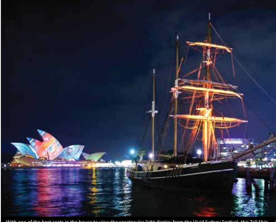
With one of the best seats in the house to view the spectacular light display from the Vivid Sydney Festival, this Tall Ship cruise will leave you with a night to remember. Come aboard and experience a night filled with laughter and entertainment amongst new and old friends alike.

For only $95 per person, the food, drink and entertainment aboard this two hour cruise, will all be provided by the friendly Ship's crew, all of whom