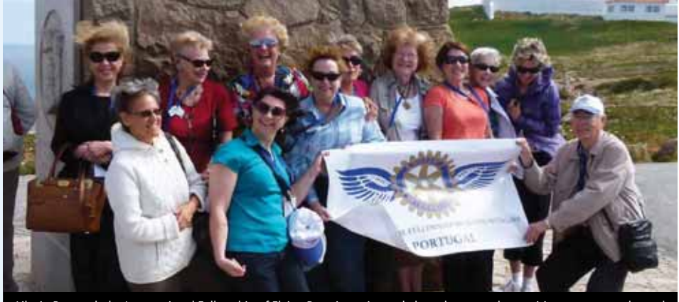
Like in Portugal, the International Fellowship of Flying Rotarians pictured above have another exciting encounter planned, which will take you from the city to the outback. Explore the red-hot centre of Australia and extend your stay in this fascinating country a little longer.

Continuing on guests will then be flown to Ayers Rock where you will get to watch the sunset over the iconic Uluru while enjoying nibbles followed by a delicious BBQ dinner and stargazing. The next