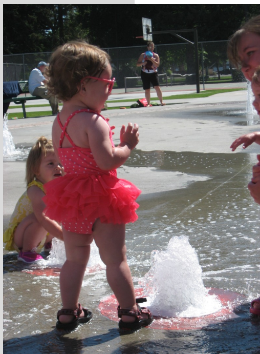
A Future Rotarian enjoys the Splash Park adjacent to the Rexburg Rotary Club Pavilion, home to a beautifully restored Carousel.