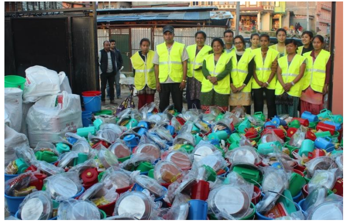
CDRA Nepal and Rotary volunteers with relief packs