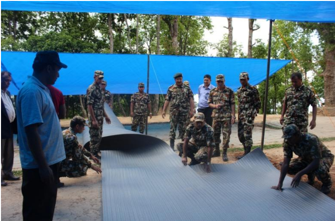
For post medical care near army camp set by Rotary