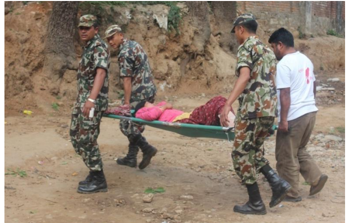
Victim bringing to hospital