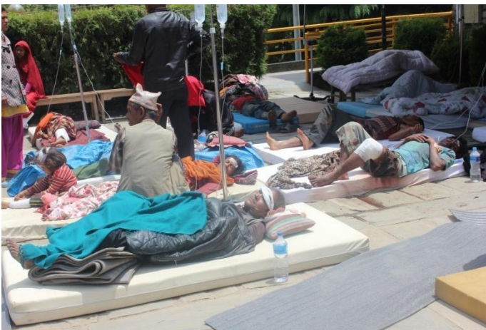
Over crowded hospital in Dhulikhel