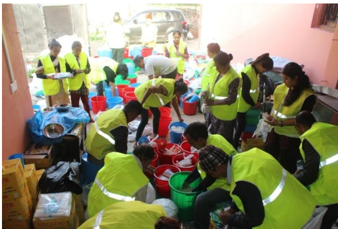
Preparation of relief packs