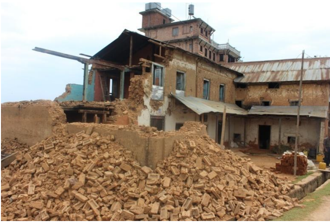
Destroyed by earthquake