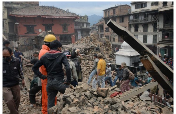
Finding dead body