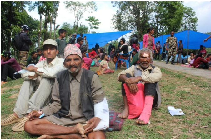
Patients waiting for treatment