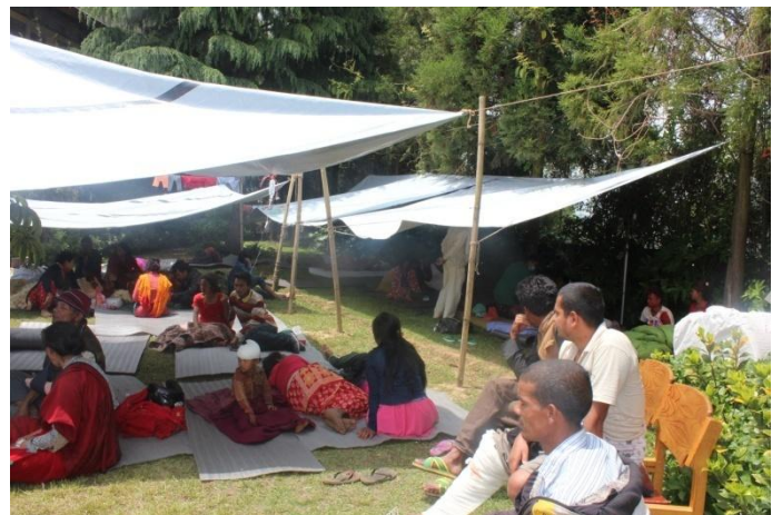
Over crowded hospital in Dhulikhel