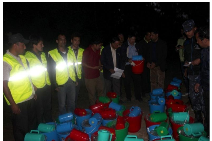
Handing over relief packs to District Disaster Relief Committee