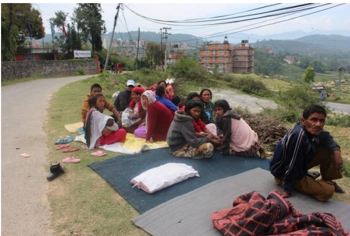
People staying nearby roadside