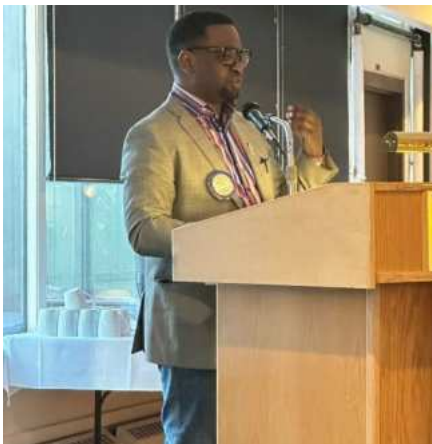
Bowling, Presentation on Cybersecurity by Ope