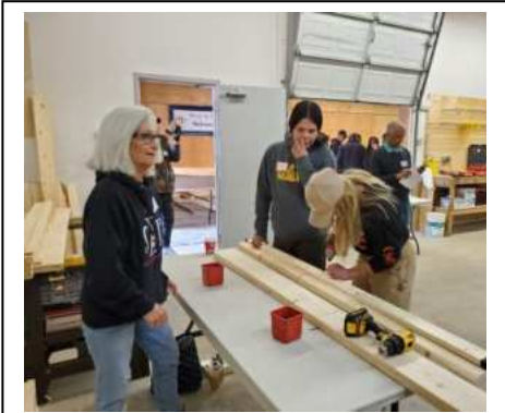
Building Beds for Sleep in Heavenly Peace

Congratulations to all. We reached our target of provision on 1,000 Survival Garden Kits to women and families in South Africa