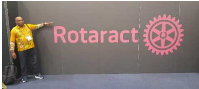
Rotarian Bagula at the International Rotary Convention in Melbourne