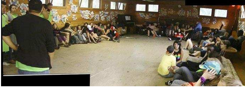
RYLA activities at the camp at Clear Lake