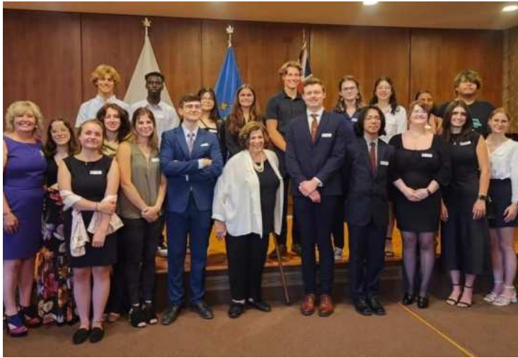
RAHR Students Reception with the Lieutenant Governor of Manitoba, Honourable Anita Neville