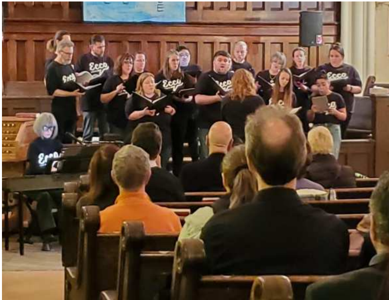
Raising funds for Oak Table with music by the ECCO Choir