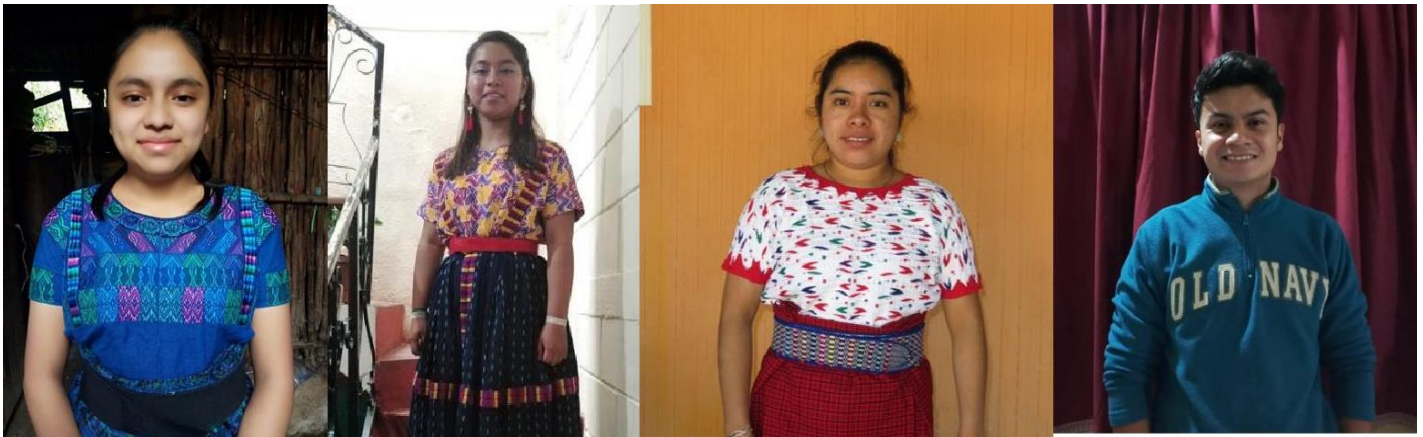
Four students - 2 nd semester of 2 nd year in 2022

Rotary Clubs, Rotarians and friends of Rotary are encouraged to support this program!