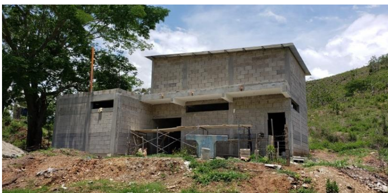
Construction of primary school washrooms