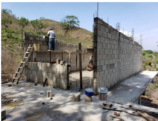
Kindergarten washroom construction