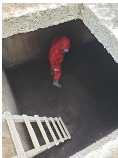
Inside septic tank

International Partner: RC Burlington Lakeshore