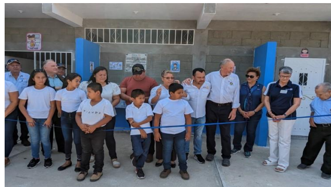
Ready to cut the ribbon.