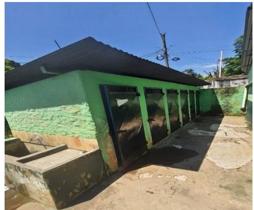
School Cabanas Sector Lopez-122 students