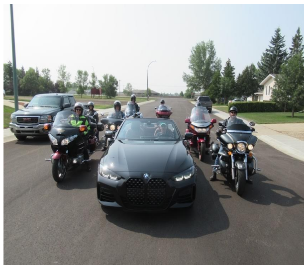
The Ripple Effect Riders