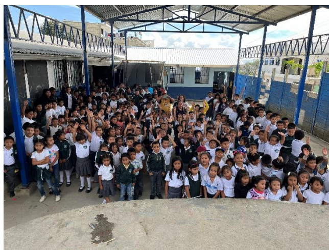
Warm welcome from students. Two new classrooms(at back) and roof over play area.

Host Club: Rotary Club of Nueva Guatemala International Club: RC of Moose JawWakamow