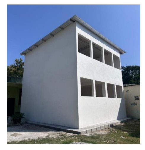
Two classrooms on two levels

Status: Construction is 95% complete Host Club: Rotary Club of Gualan International Club: Rotary Club of South Eastman