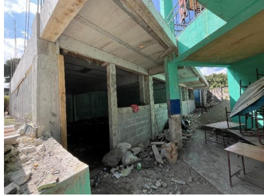
Two partially constructed classrooms

Cost estimate is $98,000 US . The municipality and community have committed to provide the skilled and unskilled labour and some materials for an approx. value of $27,000 US. Status: construction is planned to start in November