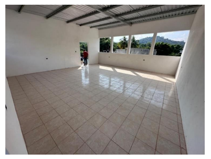
interior of the 2<sup>nd</sup> level classroom