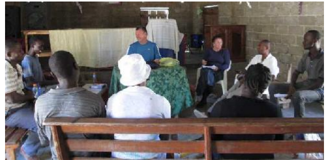
Meeting with Garde Seline Leacership Council September 2014.