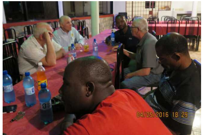
Future water/sanitation projects are discussed with members of Fort Liberte Rotary Club.