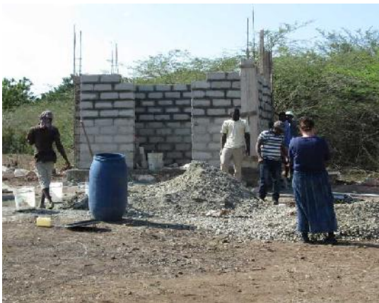
Pumphouse under construction Jan. 2015.