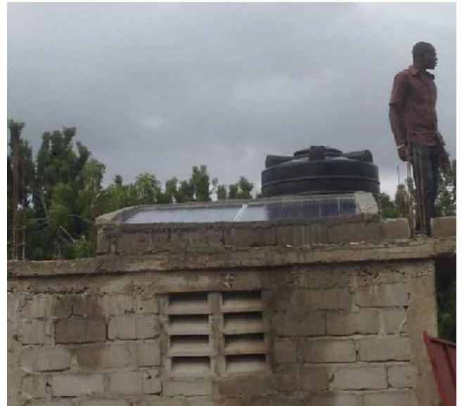
Solar Panels are installed on Pumphouse.