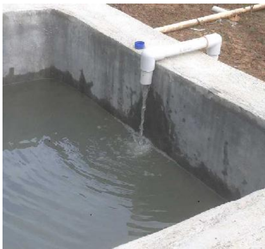
Running Water into Main Cleaning/Dunk Tank January 2016.