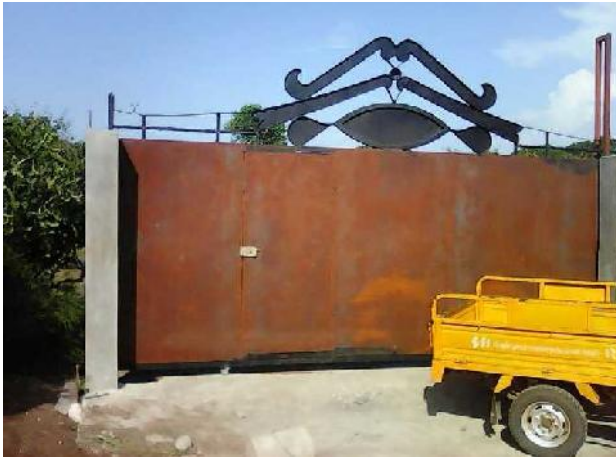
New Security Gate is installed.