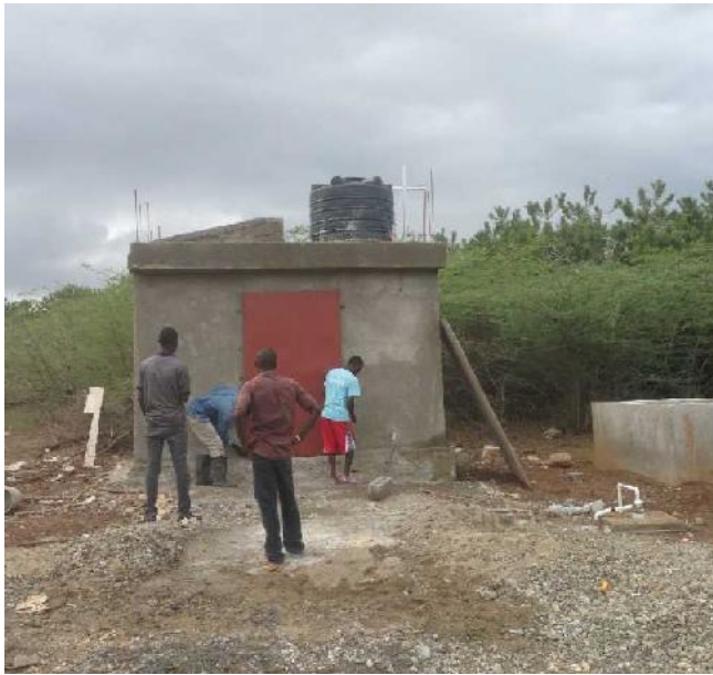
Haitian Contractor completes Pumphouse - January 2016.