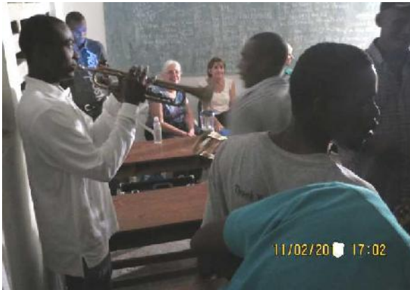
Rotarians attend Fort Liberte Rotary Club Meeting in November 2014.